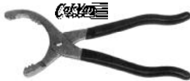
OIL FILTER PLIERS