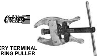
BATTERY TERMINAL & BEARING PULLER