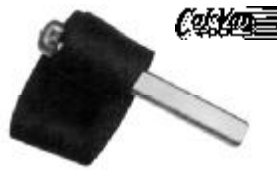
ALL SIZE FILTER WRENCH