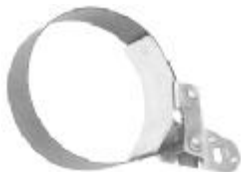
HEAVY DUTY SQUARE DRIVE TRUCK OIL FILTER WRENCHES