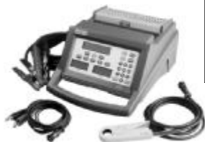
MULTI-APPLICATION ELECTRICAL SYSTEM TESTER