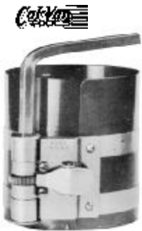
UNIVERSAL RING COMPRESSORS