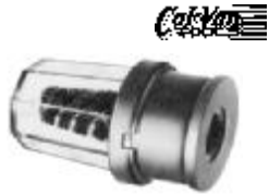
BATTERY POST & TERMINAL CLAMP BRUSH