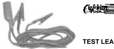
TEST LEAD KIT