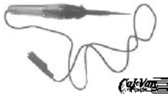
BATTERY POWERED CONTINUITY TESTER