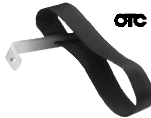
OIL FILTER WRENCH