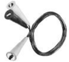
REMOTE STARTER SWITCH