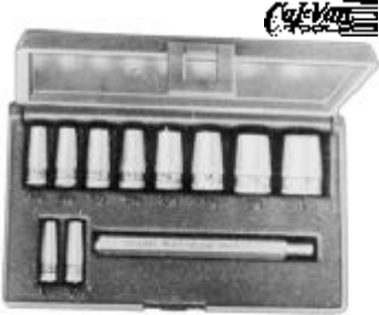
GASKET & HOLLOW PUNCH SET