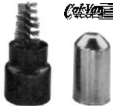
HEAVY DUTY BATTERY POST & TERMINAL END BRUSH