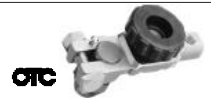
PARASITIC DRAW TEST SWITCH