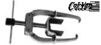
OVERHEAD VALVE SPRING COMPRESSOR