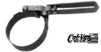
HEAVY DUTY SWIVEL OIL FILTER WRENCH