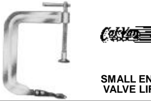
SMALL ENGINE VALVE LIFTER