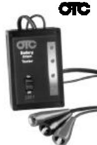
PARASITIC BATTERY DRAIN TESTER