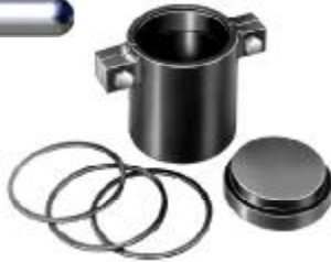
HENDRICKSON BAR PIN ADAPTER SET