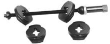
FRONT COIL SPRING COMPRESSOR