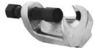
UNIVERSAL TIE ROD END REMOVER