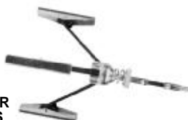
SMALL CYLINDER & BRAKE HONES