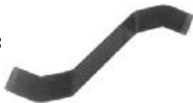
LUCAS REAR BRAKE ADJUSTING TOOL