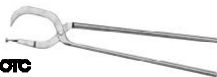
HEAVY DUTY BRAKE SPRING PLIERS