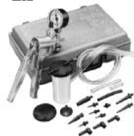
DELUXE METAL VACUUM / PRESSURE PUMP