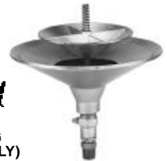
WHEEL BEARING PACKER (HEAD ONLY)