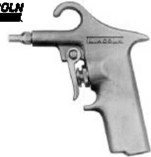
AIR BLOW GUN