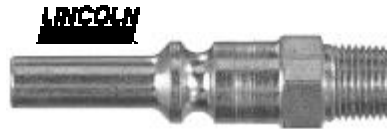
MALE AIR COUPLER NIPPLE