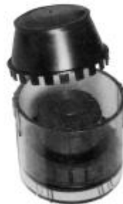
HAND BEARING PACKER