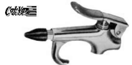
RUBBER TIPPED BLOW GUN