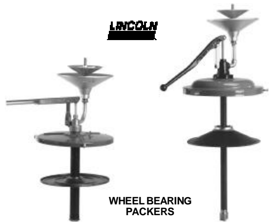
WHEEL BEARING PACKERS