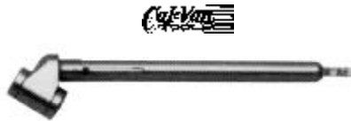
DUAL FOOT POCKET GAUGE