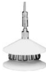
WHEEL BEARING PACKER