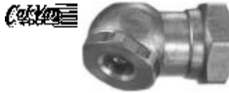
SINGLE FACE AIR CHUCK