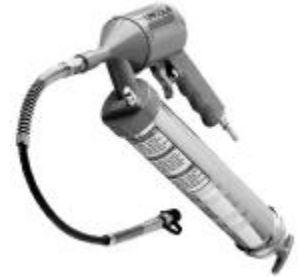
AIR OPERATED GREASE GUN