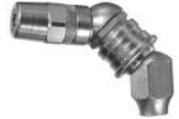
360 DEG. COUPLER ADAPTER