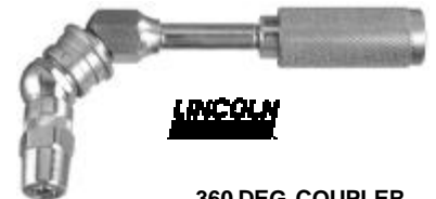
360 DEG. COUPLER ADAPTER ASSEMBLY