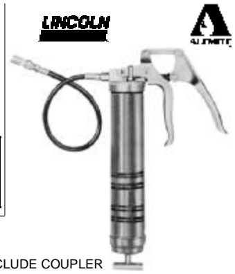
PISTOL GRIP GREASE GUNS