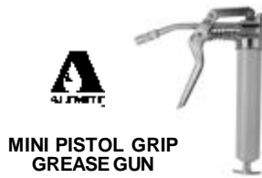
MINI PISTOL GRIP GREASE GUN