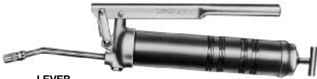
LEVER GREASE GUNS