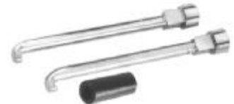
STEERING WHEEL PULLER LEG SET