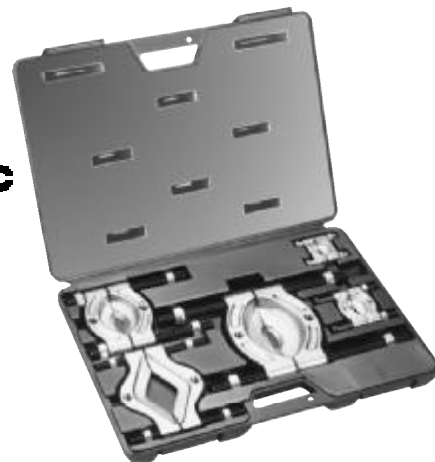
PULLING ATTACHMENT COMBO SET