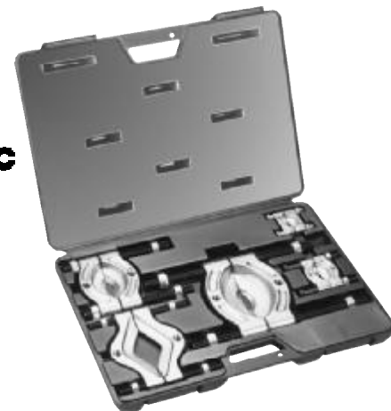
PULLING ATTACHMENT COMBO SET