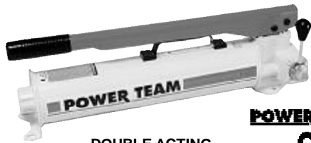
DOUBLE ACTING HAND PUMPS