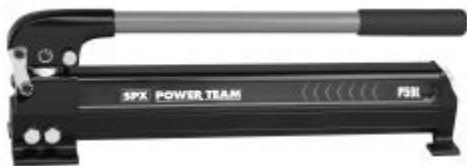
LIGHTWEIGHT HAND PUMPS (SINGLE ACTING)