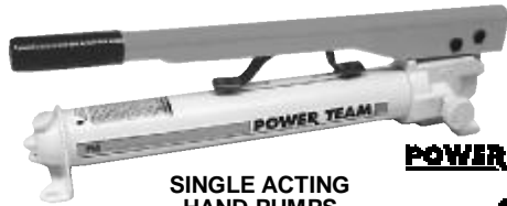
SINGLE ACTING HAND PUMPS