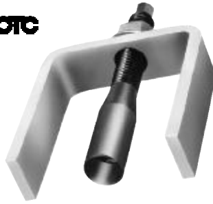
STEERING WHEEL LOCKPLATE REMOVER