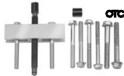
STEERING WHEEL PULLER