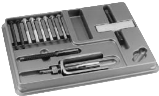
STEERING WHEEL LOCKPLATE SET