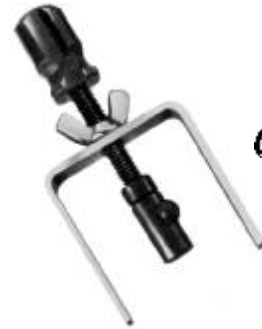
STEERING WHEEL LOCKPLATE REMOVER