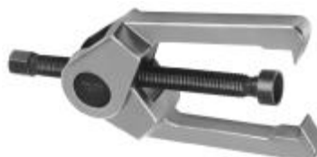
OUTER TIE ROD REMOVER