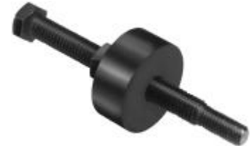
GM POWER STEERING PUMP PULLER INSTALLER