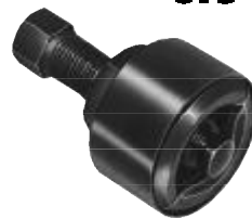
POWER STEERING PUMP & ALTERNATOR PULLEY REMOVER