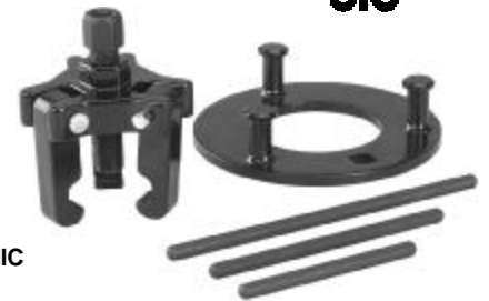
GM / CHRYSLER HARMONIC BALANCER PULLER