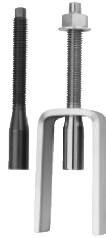
STEERING WHEEL LOCKPLATE PULLER