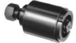
COMPRESSOR DRIVE GEAR PULLER