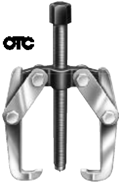
DIFFERENTIAL BEARING PULLER