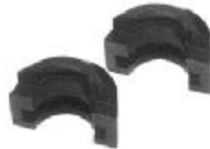
DIESEL VACUUM PUMP PULLEY REMOVER JAWS