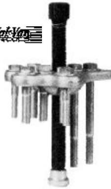
HARMONIC BALANCER PULLER