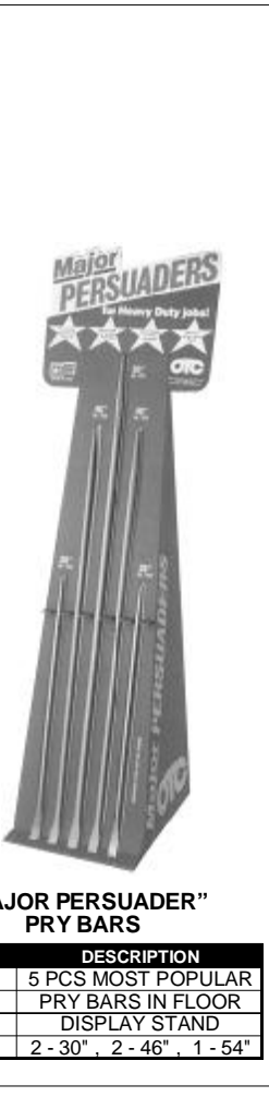
"MAJOR PERSUADER" PRY BARS