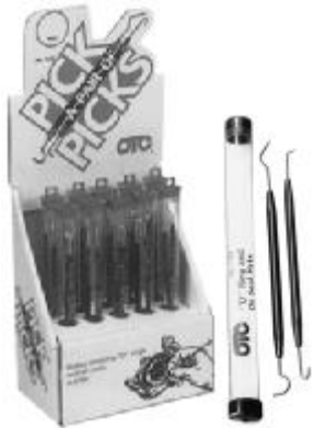
"O" RING PICKS