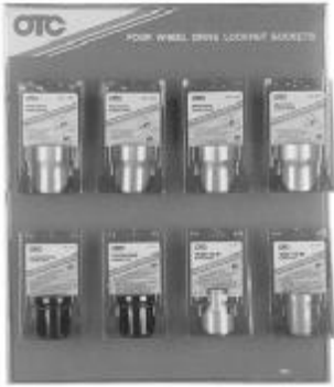
4WD LOCKNUT SOCKETS