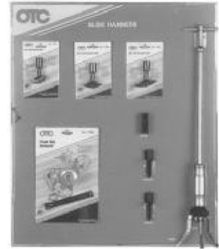
SLIDE HAMMER PULLERS