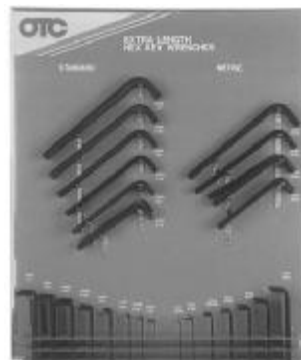
HEX KEY WRENCHES