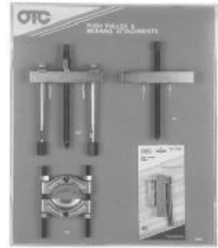
PUSH-PULL TYPE PULLERS