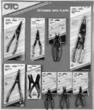
RETAINING RING PLIERS