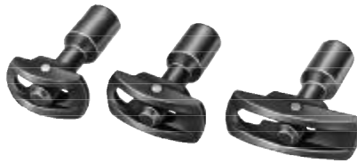
REAR AXLE BEARING PULLER