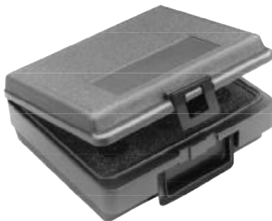
METRIC THREADED ADAPTER SETS