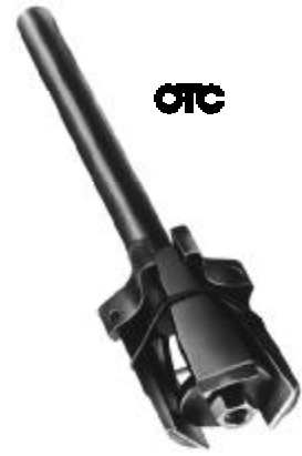
UNIVERSAL BEARING CUP INSTALLER