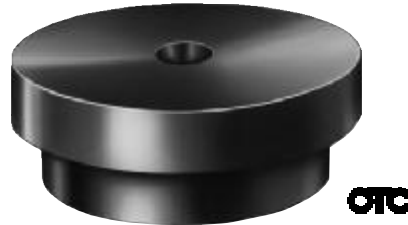
STEP PLATE ADAPTERS