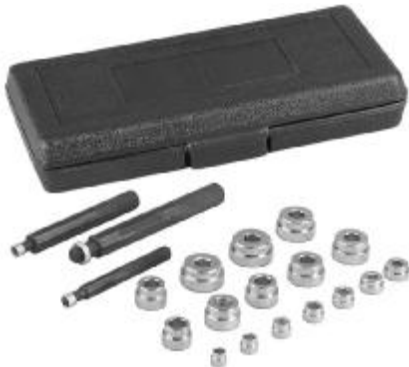
BEARING RACE & SEAL DRIVER SET