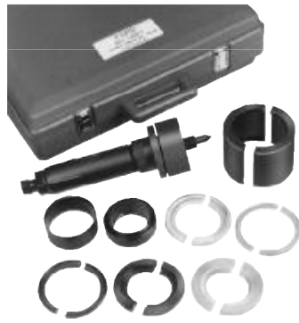
PINION & CARRIER BEARING PULLER