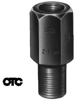
FEMALE - MALE THREADED ADAPTERS