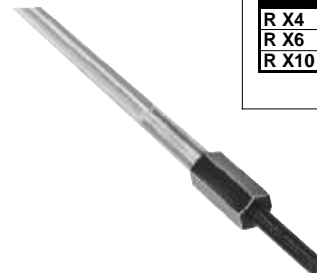
GRIP WRENCH ADAPTER