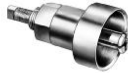
CONVEYOR ROLLER BEARING PULLER