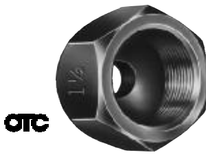
FEMALE - FEMALE THREADED ADAPTERS