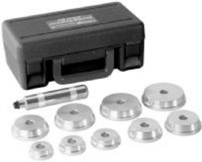
BUSHING DRIVER SET