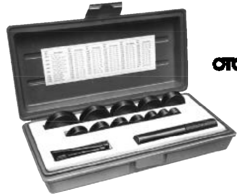
BUSHING DRIVER SET